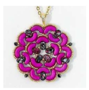
19) Another color 😊

I wish you a happy beading. I offer you this pattern. Please do not change its design and only use Les Perles par Puca®- Paris If you publish or share this pattern, thank you for not forgandting to notify that it is Puca® who created it.