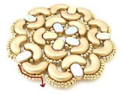
14) Here is the result © Exit through penultimate SB15 HERE