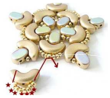
8) Insert 1 Arcos, 7 SB15 through the Arcos then through the central SB11 HERE