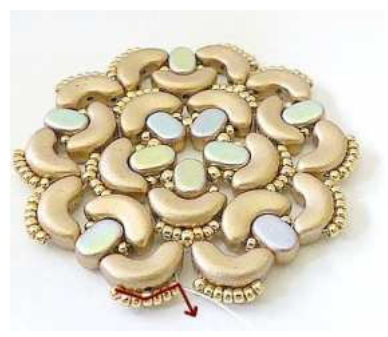
10) Here is the result © Exit through the seed beads HERE