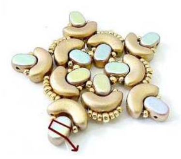
7) Here is the result © Exit through the second hole of the Lipsi