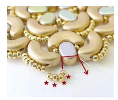
12) Insert 4 SB15 through the Lipsi HERE