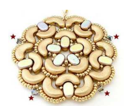
17) Here is the result © Insert 4 B3. End your thread ©