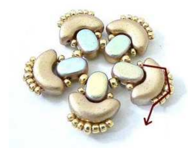
5) Here is the result © Exit HERE through seed beads