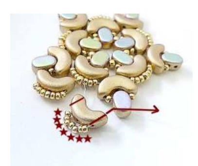
9) Insert 1 Arcos, 7 SB15 through the Arcos and next Lipsi HERE. Repeat steps 8 and 9 all the round