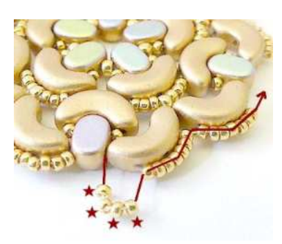
13) Insert 4 SB15 through the 14 seed beads HERE. Repeat steps 11 to 13 all the round