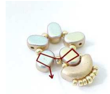
4) Exit HERE. Repeat steps 3 and 4 all the round

3) Insert 1 SB15, 1 Arcos, 3 SB15, 1 SB11 and 3 SB15 through the Arcos. Insert 1 SB15 in the Lipsi of exit