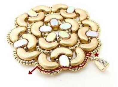
15) Insert the bail and reinforce. Exit HERE from the first nine SB15