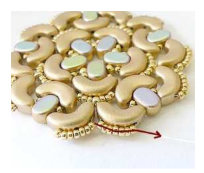
11) Exit through the next seed beads HERE