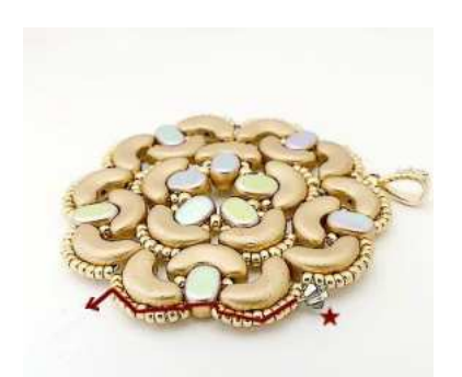
16) Insert 1 B3 in the last nine SB15s and exit HERE through the first SB15s. All the way around ©